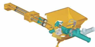
Worldwide Preferred 'S' Valve Technology